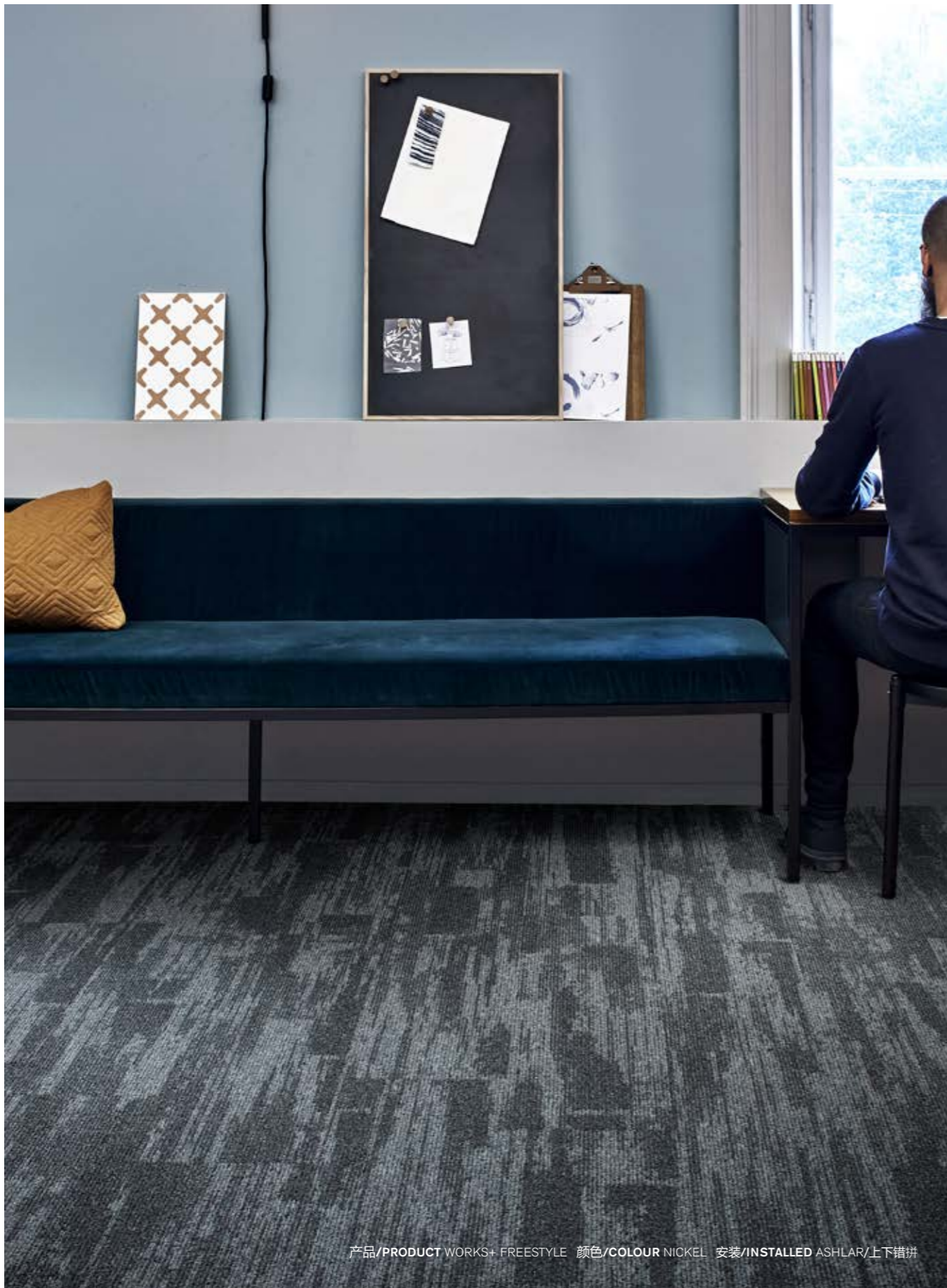
产品/PRODUCT WORKS+ FREESTYLE 颜色/COLOUR NICKEL 安装/INSTALLED ASHLAR/上下错拼