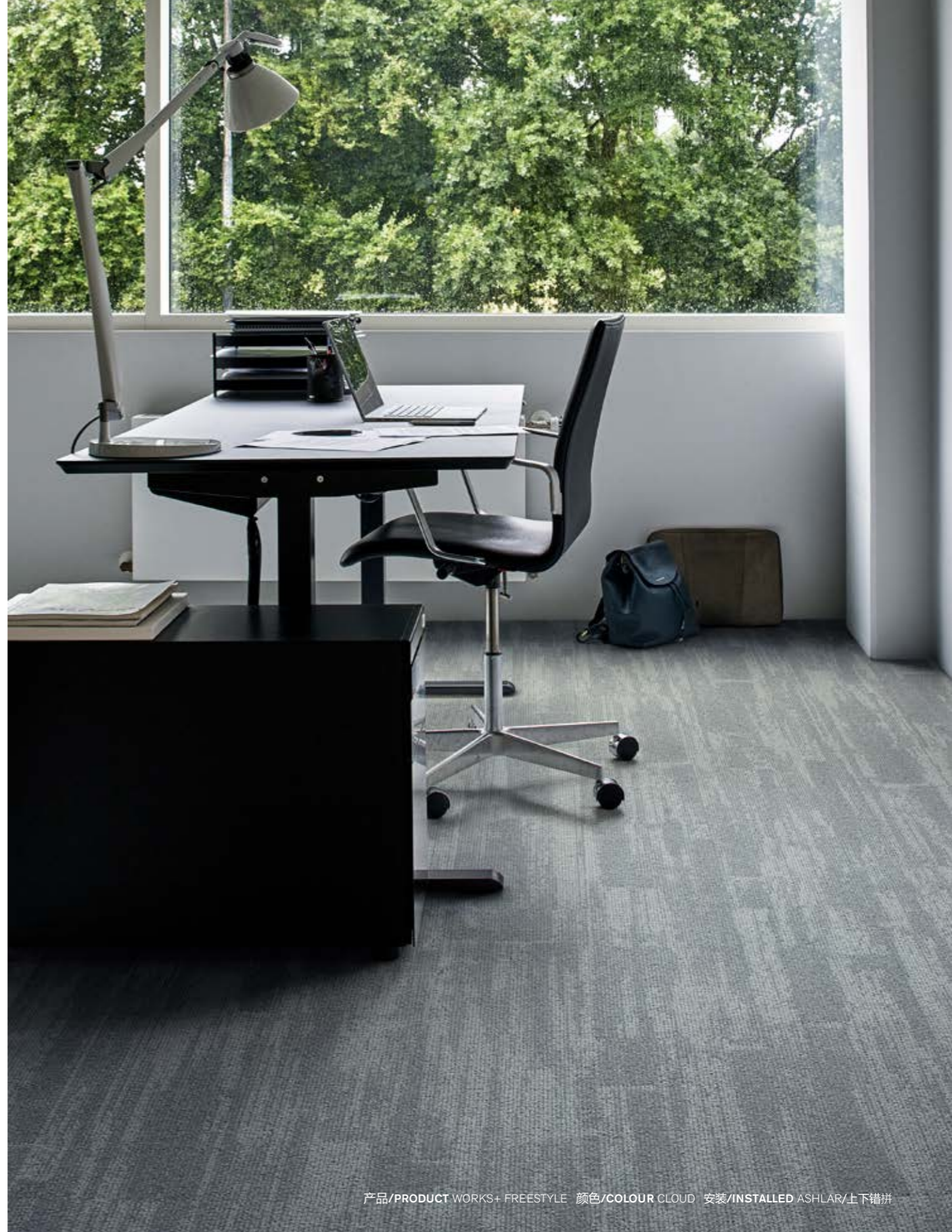
产品/PRODUCT WORKS+ FREESTYLE 颜色/COLOUR CLOUD 安装/INSTALLED ASHLAR/上下错拼